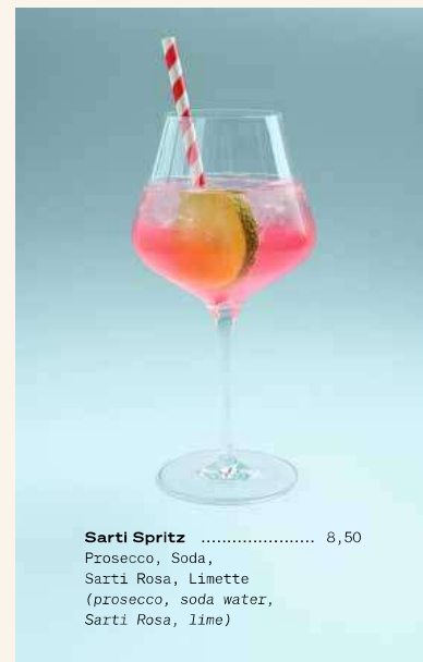
Sarti Spritz ..... 8,50 Prosecco, Soda, Sarti Rosa, Limette (prosecco, soda water, Sarti Rosa, lime)