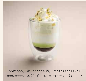
Espresso, Milchschaum, Pistazienlikör espresso, milk foam, pistachio liqueur